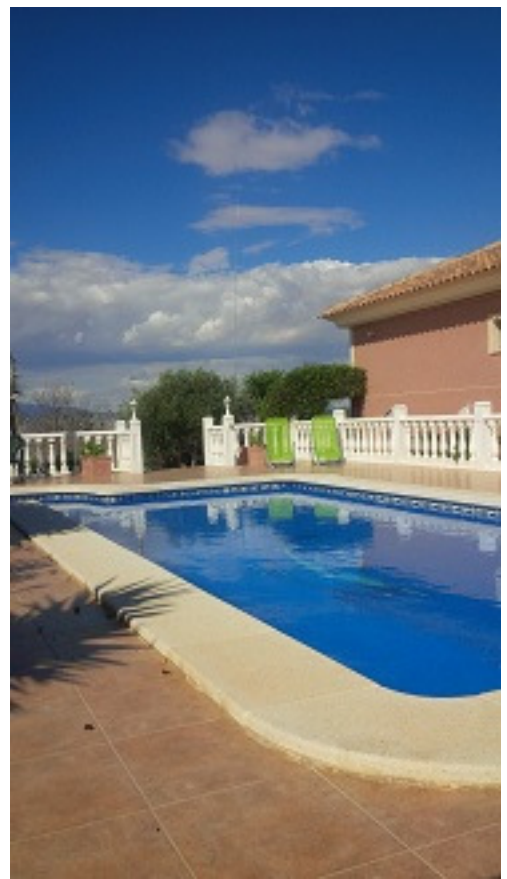
Spot the Mast