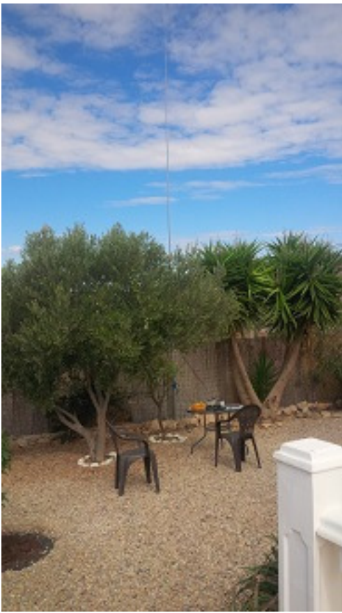
The Station Location