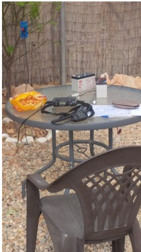
The Popcorn is Essential!